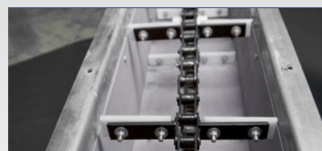
RETURN ROLLERS & LINING